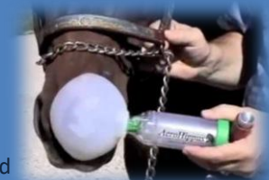
Steroid and bronchodilator inhaler commonly used